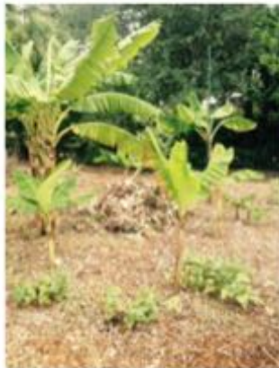
Food Forest – Banana Circle