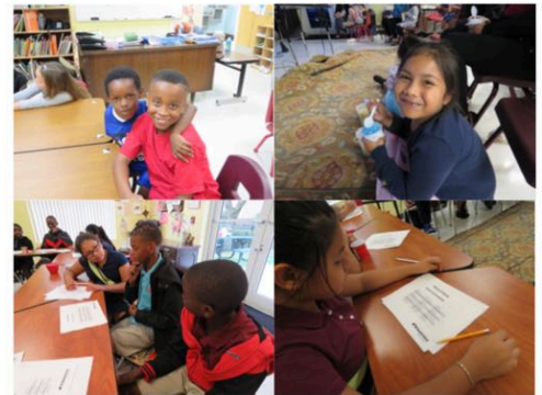
Children in Project Grow: