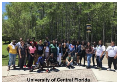
University of Central Florida

For the most part, none of them have left their neighborhoods, much less seen a college campus. In our experience, we have found that the students who are exposed to college tours, field trips and other enrichment activities develop a strong interest in pursuing a higher education and ultimately a rewarding career in life. We rented a bus and provide the kids with lunch on campus while we were at both schools. The cost of the bus is roughly $1000 per day with a nonprofit discount and the meals over two days cost approximately $1500 total for 30 persons (students and chaperones). We stayed in a discount hotel and had 18 rooms at $50 per night. We are fully insured and all of our volunteers and chaperones have had a full background check. I am including some photos of the tours. The kids had a fantastic time both days.