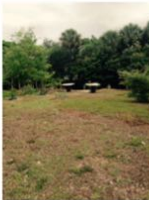
Area Available for Expansion

Pictured to the left is the area between the Wildflower Walk and Permaculture Food Forest. There is a lot of room for expansion.