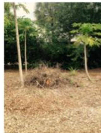
Food Forest – Papaya Circle