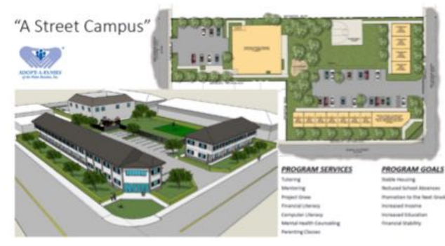
Rendering for the “A Street Campus”: