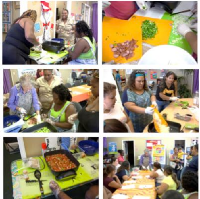
The Glades Initiative Cooking Matters Class

From January 2017 through March 2017, our Glades Area Food Bank supported 14 member food distribution sites, including two on-site feeding centers. Those sites provided 7,509 Households (duplicated) with food, serving 24,468 extended family members within those households (duplicated). In addition, our soup kitchens/on-site feeding