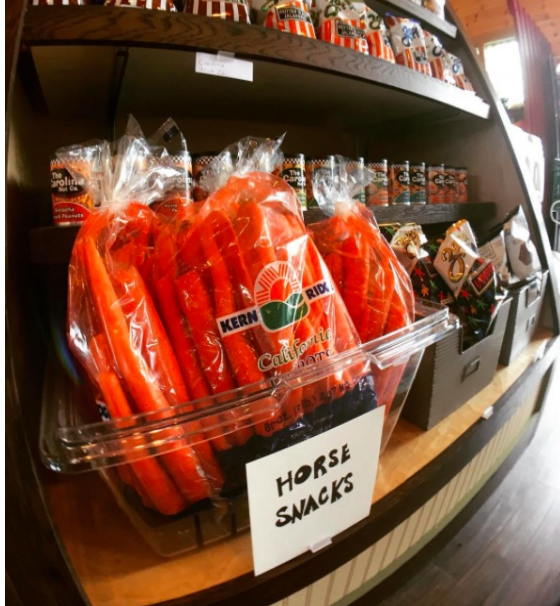
@tryonresort - Did your horse have a great weekend at TIEC? Pick up a treat for him (and you!) at our new #generalstore