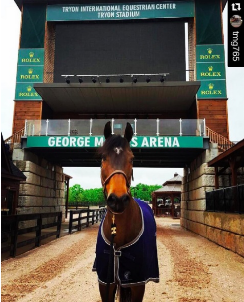
@tryonresort - This spring chicken was a ball of energy finishing 5th in his first #fei class back this afternoon in #tryon for the CSI 3! #Onira #BGLLC