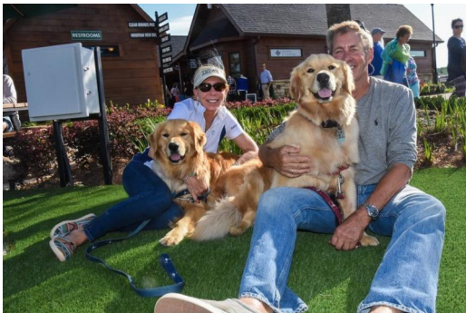
Some gorgeous puppies enjoying SNL!

Click here to view highlights from our first Saturday Night Lights of the 2016 season on the official Tryon International Equestrian Center Facebook page!