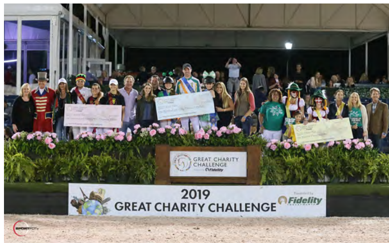
The top three teams, along with their charity and team sponsor representatives, for the 2019 Great Charity Challenge, presented by Fidelity Investments®.

CROWNS HOLY GROUND SHELTER FOR THE HOMELESS AS WINNER