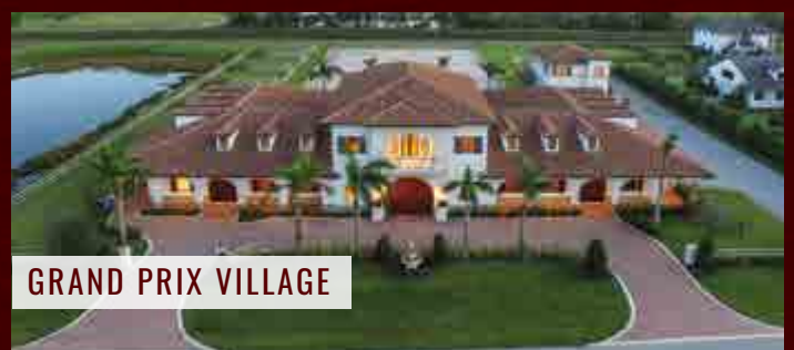
GRAND PRIX VILLAGE

Coronet Farm | 5261 Laredo Way | Offered At $13,150,000 14-stall barn, 4 bedroom house, 2 bedroom caretaker's cottage, 1 bedroom pool house