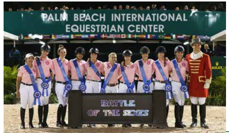
The women took home their seventh win in eight years in the first "Saturday Night Lights" event of the season at the Battle of the Sexes.

Men and Women were pitted against each other for the eighth annual $75,000 Battle of the Sexes in front of a crowd of more than 5,000 spectators during the first "Saturday Night Lights" of the 2016 Winter Equestrian Festival. After three rounds of competition that ended in a duel between the final two riders, the women broke the tie that ended the 2015 battle to come out on top this year.