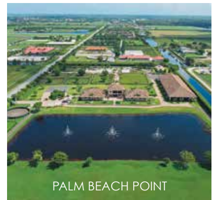
PALM BEACH POINT