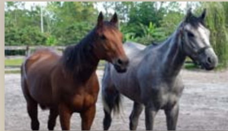
Above: Rain & Our Fever rescued from a feedlot in Louisiana this past May 2015. Both arrived extremely underweight, malnourished and having been abused. Months later, they are doing wonderfully, in great health and incredibly personable.

Pure Thoughts Inc. is an all volunteer 501c3 non-profit organization dedicated to saving the lives of horses, yearlings and foals that were bound for slaughter, victims of starvation, neglected, abandoned or abused. To date, Pure Thoughts has helped save over 1,700 horses.