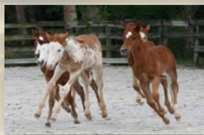
Above: Every year we participate in our nurse mare foal rescue. These are foals that were born from a mare that was bred for the sole purpose of providing milk to another, more expensive foal. The nurse mare's foal is no longer needed after they are born; they're left orphaned and ultimately die. The foals above are a few from our 2013 mission.