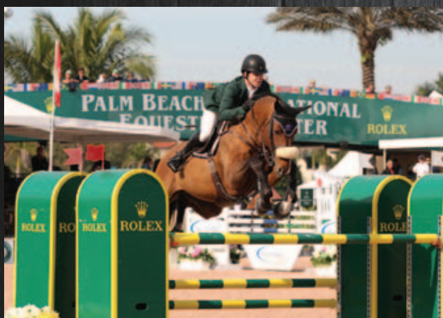
Venturo 9 2005 16.3h Bay SBS BWP Stallion Canturo - Nabab De Reve - You Only X