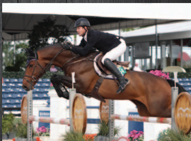
Chaqui Z 2006, 16.1 1/2 h, Bay, Zangersheide BWP Stallion Chacco Blue - Quinar Z - Cathago Z