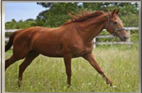
Above: Hasty Red was rescued from a severe abuse case, yet he now has healed from his trauma lives a full, peaceful life.

We've dedicated the past decade to helping change the life of horse's lives who were bound for grave endings. Our work may not change the world, but it will make a difference in how animal welfare is viewed and fought for in the future. Please help us continue this fight against cruelty.