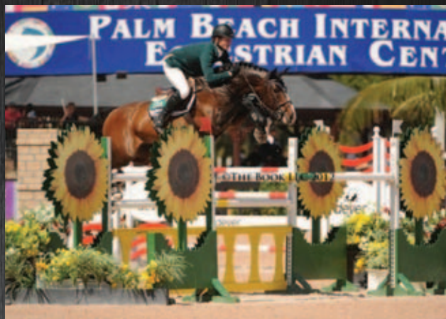
Cyklon 1083 2001 SWB BWP Elite Stallion (Cardento - Cortus - Falstaf)