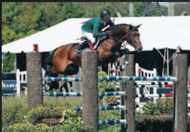
Diktator Van De Boslandhoeve 2003 BWP Elite Stallion (Thunder Van De Zuuthoeve-Capital-Lys De Darmen)