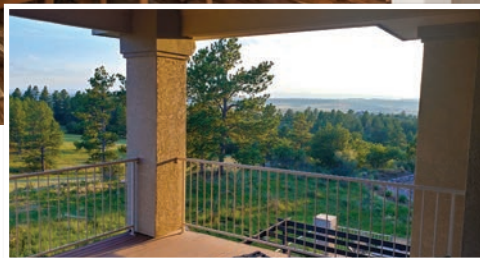
LUXURY HOME CLOSE TO CHP Air BnB https://goo.gl/KxfMVy